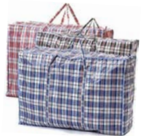
Example of a bag that can easily tear during handling

Passengers travelling with large groups, sporting equipment or significant amounts of baggage may be required to purchase additional baggage allowance, where applicable.