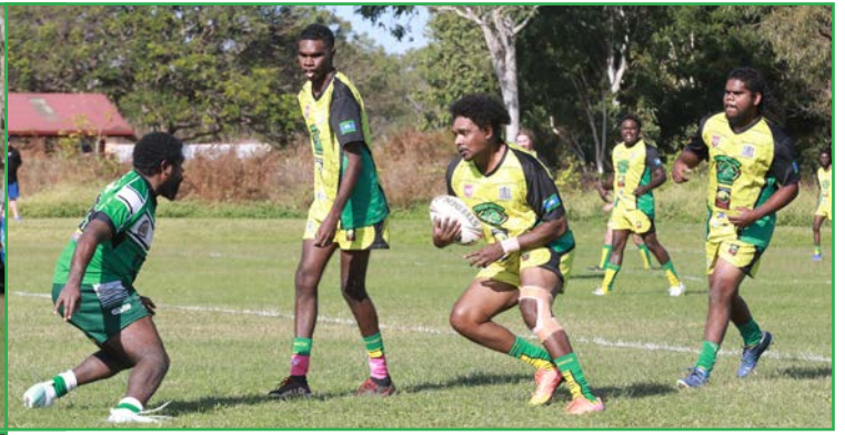
SOUTHERN CLUSTER: ROUND 1 LAKELAND DOWNS